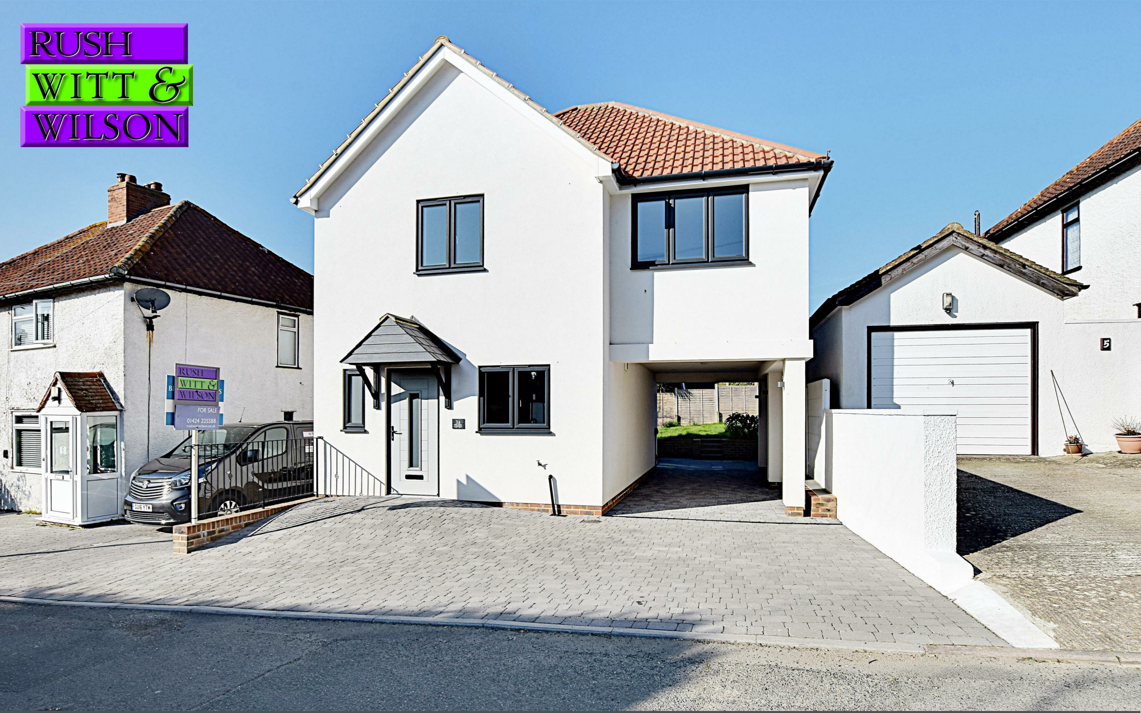
3a Little Twitten, Bexhill-On-Sea, East Sussex TN39 4SS Guide Price £425,000